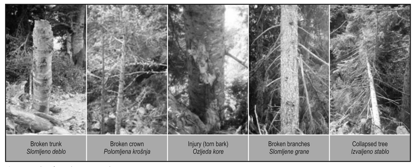
Fig. 2 Samples of tree damage in study area

This study has been made throughout 3,100 m of forest road construction area in the Gumushane (Kurtun region of Turkey). The road started at 510,050 m, 4,511,145 m coordinates at UTM projection system with ED 50 datum in 37 T square and ended at 510,375 m, 4,510,865 m point location. The