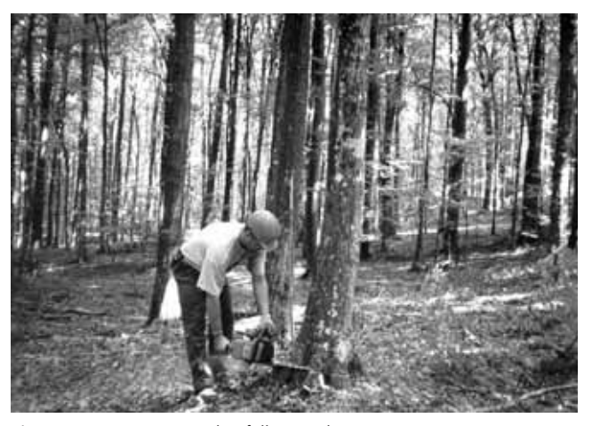
Figure 2 Cutter engaged in felling and processing Slika 2. Sjekač pri sječi i izradbi stabla

The effective time of the tractor E per unit is 21.64 \, \text{min/m}^3 , and of the tractor T 20.67 \, \text{min/m}^3 , which is by 4.5 \, \% lower than the tractor E. Total time consumption per unit of the tractor E is 42.05 \, \text{min/m}^3 , and of the tractor T 35.04 \, \text{minutes} and hence by 7.01 \, \text{min/m}^3 lower. The average daily efficiency of the tractor E is 9.98 \, \text{m}^3/\text{day} , and of the tractor T it is 11.43 \, \text{m}^3/\text{day} . The tractor T skidded on average 1.45 \, \text{m}^3/\text{day} more than the tractor E, which is by 12.7 \, \% more.