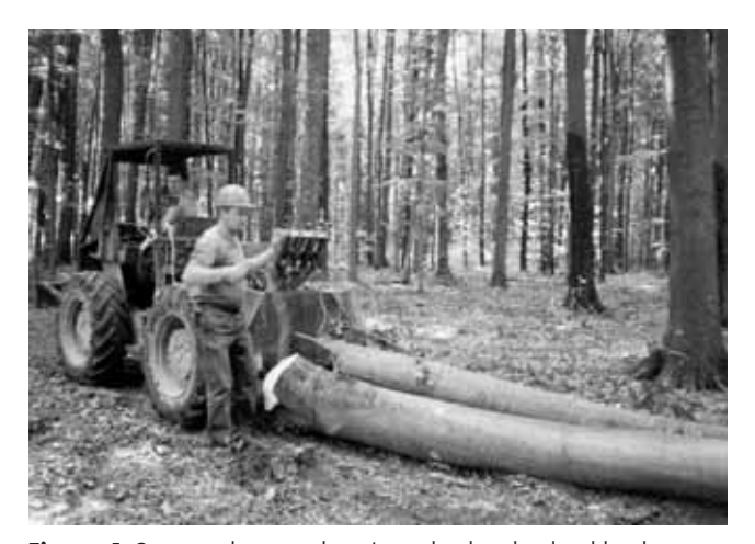
Figure 1 Cutter and tractor driver's work related to load hooking Slika 1. Sjekač i traktorista pri vezanju tovara

task of the work team is to achieve better connection and performance of all operations, starting with the preparation work and ending with the delivery of the forest assortments to the buyer. The basic characteristics of teamwork is a single work order determined on the basis of individual daily standard efficiencies of each member of the team. The daily standard efficiency is calculated and showed averagely per member of the team. The workers carry out the work at the same workplace with the same means and object of work (Fig. 1).