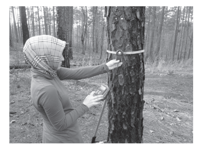
Fig. 3 Light conditions being measured using the Mastech LX1330B light meter

time and consistent measurement collection. For this study, the direct caliper measurement was assumed to be the best or the »true« diameter. We allowed up to 30 seconds for each individual remote caliper measurement. The diameter tape measurements were collected for reference purposes, as this is a common method used in the southern United States. Measurements made using diameter tapes have been shown to be different than those collected using calipers (McArdle 1928), and technically should not be directly compared to single caliper measurements or sector-fork measurements given the irregular shape of most tree boles (Brickell 1970, Moran and Williams 2002). However, for illustrative purposes, we make those comparisons in this study.