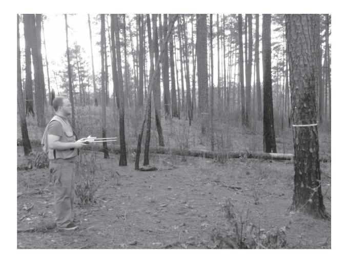
Fig. 2 Remote measurements conducted with the laser caliper dendrometer

time and consistent measurement collection. For this study, the direct caliper measurement was assumed to be the best or the »true« diameter. We allowed up to 30 seconds for each individual remote caliper measurement. The diameter tape measurements were collected for reference purposes, as this is a common method used in the southern United States. Measurements made using diameter tapes have been shown to be different than those collected using calipers (McArdle 1928), and technically should not be directly compared to single caliper measurements or sector-fork measurements given the irregular shape of most tree boles (Brickell 1970, Moran and Williams 2002). However, for illustrative purposes, we make those comparisons in this study.