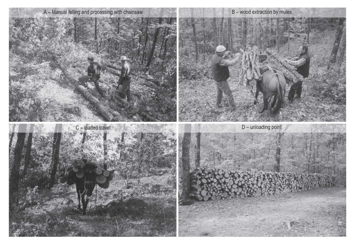
Fig. 2 Manual felling and processing with chainsaw (a), wood extraction by mules (b), loaded travel (c) and unloading point (d)

All harvesting operations were conducted by a team of three forest workers who used chainsaws for tree felling, delimbing and bucking in October 2001. The forest workers had an average of 12 years of experience felling, delimbing and bucking in thinnings and clearcut areas. Once severed from the tree, processed firewood and thicker branches were bunched together